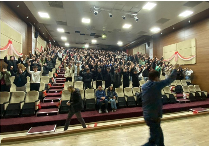
Süleyman Belediöğlü events were held in Samsun and its provinces on 12-13 December 2024. Samsun Promotion Office personnel delivered presentations at the said event.