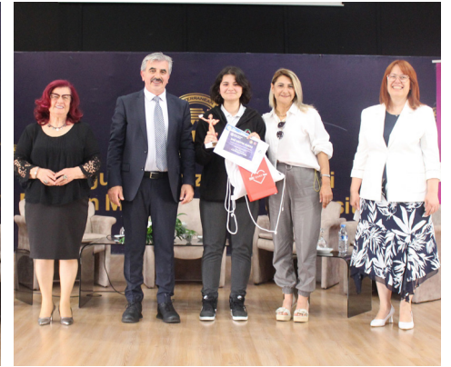
students who succeeded in the competition will be provided with the opportunity to attend a training of their choice for free by EMU-CEC.