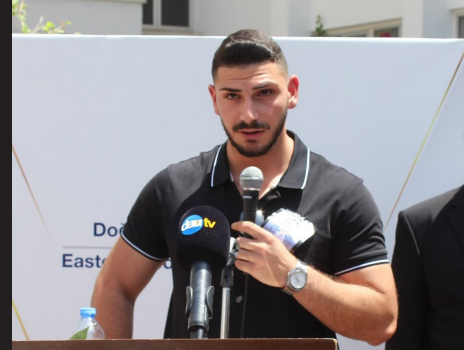
astern Mediterranean University