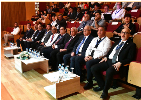
International Congress on Advances in Civil Engineering Hosted By EMU Commences