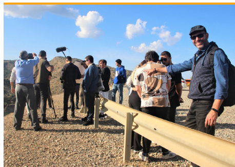
EMU Faculty of Communication's CMC Documentary Qualifies For Final in The 33 rd Young Communicators Competition