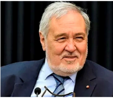
Prof. Dr. İlber ORTAYLI