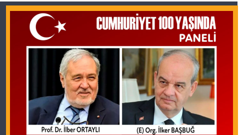
EMU to Hold a Panel Titled "The Republic at Its 100th Anniversary"