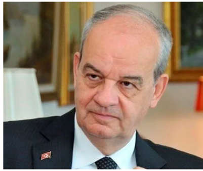
(E) Org. İlker BAŞBUĞ