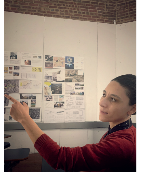
Program: Co-Op Market